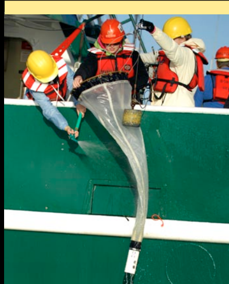
Students from Humboldt State University in California take water and sediment samples aboard the Coral Sea .