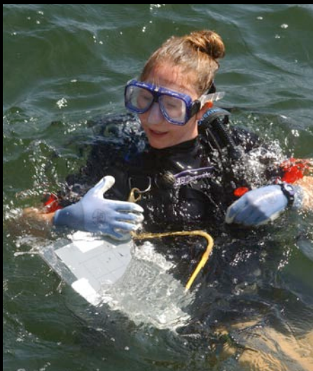
An archaeology student at University of West Florida returns from diving on Emmanuel Point II , a 16th-Century Spanish shipwreck.