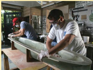
Engineering students get hands-on at the Webb Institute in Glen Cove, NY.

Check our upcoming issues for part two of our groundbreaking series on marine education. We'll look at technical training, the best programs across the country, available careers, and the state of the marine industry.