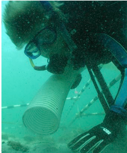
A University of West Florida archaeology student works to excavate the Emmanuel Point II , one of 11 ships that brought colonists and soldiers to Florida in 1559.

To fill that gap we've surveyed some of these programs, and created our own BoatU.S. Magazine list of the top boating colleges in the country — schools that offer the best mix of water-oriented studies and