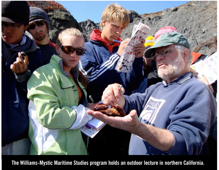
The Williams-Mystic Maritime Studies program holds an outdoor lecture in northern California.

For those who seek top-level competition, collegiate boating offers plenty of sport, and a great way to spend regular time on the water with like-minded pals. College watersports are just quirky enough to elude regulation by the National Collegiate Athletic Association (NCAA). Instead, each of these sports — waterskiing, sailing, and bass fishing — is governed by an organization of its own, each one different from the others. Visiting the web site for the governing body of your favorite watersport will give you an overview of the