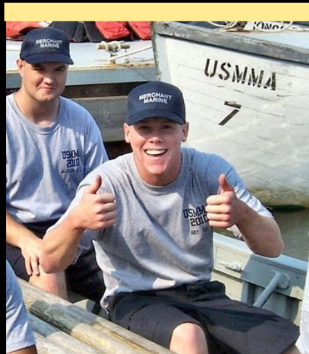
Students at three service academies trade tuition and sea time for national service.