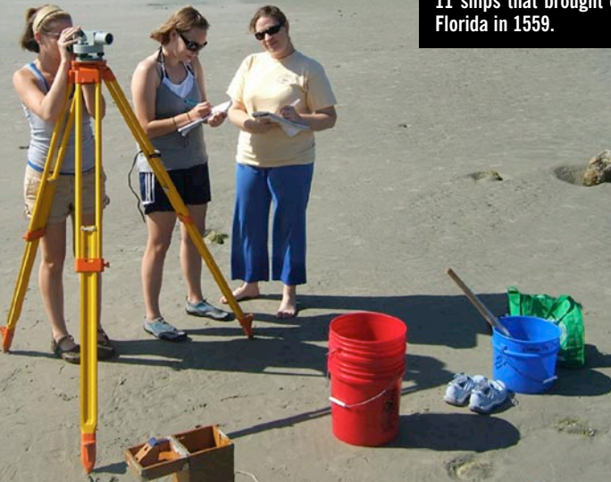
Florida Institute of Technology students survey Sebastian Inlet, Florida.

fun. We found marine-based programs aimed at students whose interests range from engineering to science to liberal arts, as well as hundreds of teams and clubs that offer coaching and camaraderie in waterskiing and sailing, even competitive bass fishing. A comprehensive list of all these programs, including links, can be found at www.BoatU.S.com/Colleges For now, let's scan the horizon.