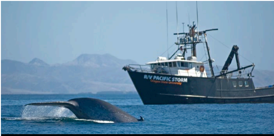
Sperm whales are observed by students from the Marine Mammal Institute and Oregon State University aboard the school's Pacific Storm .

on campus. "The great thing about college waterskiing," he says, "is that you've got kids who are very recreational at tournaments all the way to world champions."