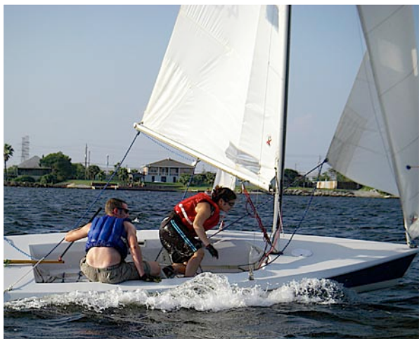
The Texas A&M at Galveston sailing team are on the water virtually every day of the year (top).

Moving on from engineering and hard science, maybe you'd rather read and write about history or literature or the social sciences. In that case, check out some of the college programs that offer bachelor-of-arts degrees in maritime studies, or fields related to boating such as Caribbean studies or maritime archeology. A pair of students doing fieldwork at the maritime studies program at the University of West Florida in Pensacola recently discovered the remains of a Spanish colonization fleet wrecked in 1559, more than 60 years before the Pilgrims landed at Plymouth. Not a bad bonus for an afternoon of scuba diving. If your time on the