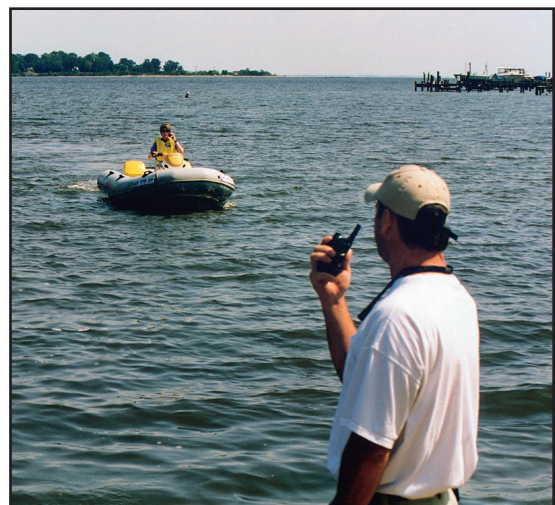
Foundation testers select a subchannel (at top). Family radios are a handy option for short range ship-to-shore communications.