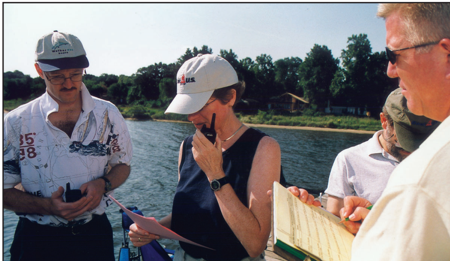
Testing entailed reading scripted sentences over the air at half-mile intervals. Eleven models of FRS and GMRS radios (at right) were tested on land and water.

Since the claims for both types of radios relate to broadcast range, we decided to put the units to an on-the-water distance test while taking notes on the clarity of the transmissions as well as ease of operation. For testing, we selected 11 pairs, five FRS and six GMRS, from