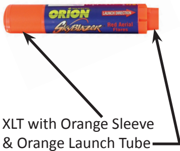
XLT with Orange Sleeve & Orange Launch Tube